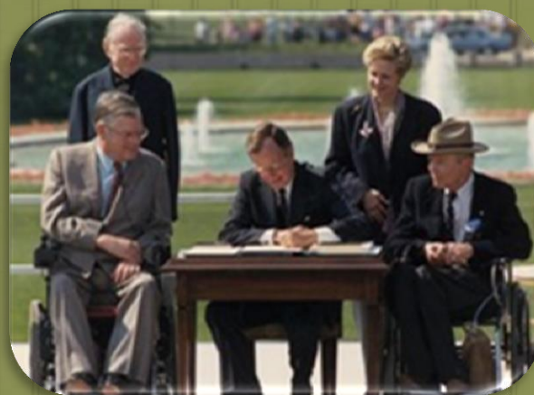
President George H.W. Bush signs the Americans with Disabilities Act on July 26, 1990.

The Americans with Disabilities Act is now 23 years old. This law, signed by President George H.W. Bush on July 26, 1990, aimed at eliminating discrimination against people with disabilities and ensuring equal opportunity for them has seen a rocky road full of non-compliance.